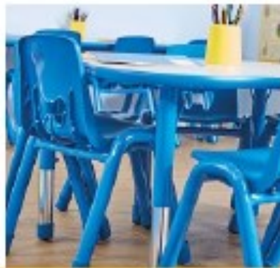
New Classroom Furniture