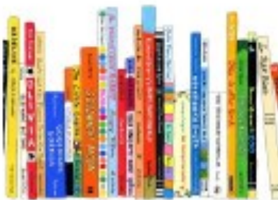
New Library Books

SOME OF THE RESOURCES YOUR FUNDS HAVE PROVIDED THIS YEAR INCLUDE: